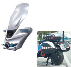
Police Kit 1 Police Front cover with Screen, fittings set and 3 suitcases