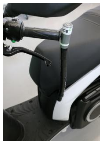
Anti-theft for handlebar Model S01