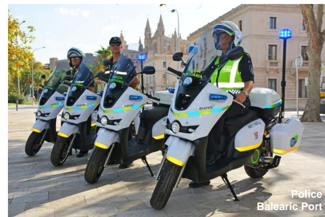
Police Balearic Port

*Prices without VAT and excluding transport costs