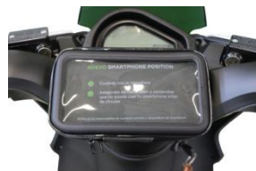
Smartphone dock For all Silence models with zipper.