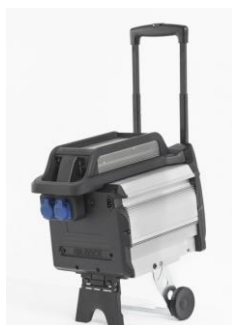
Portable Inverter 700W The accumulated energy of the Battery Pack is able to be used for other applications. The inverter is transportable under the seat, with two SCHUKO outputs.