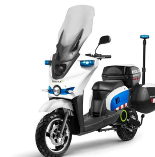
Police Kit 2 Lights, megaphone, battery and Pentapol installation