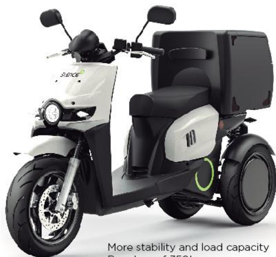
More stability and load capacity Rear box of 350L